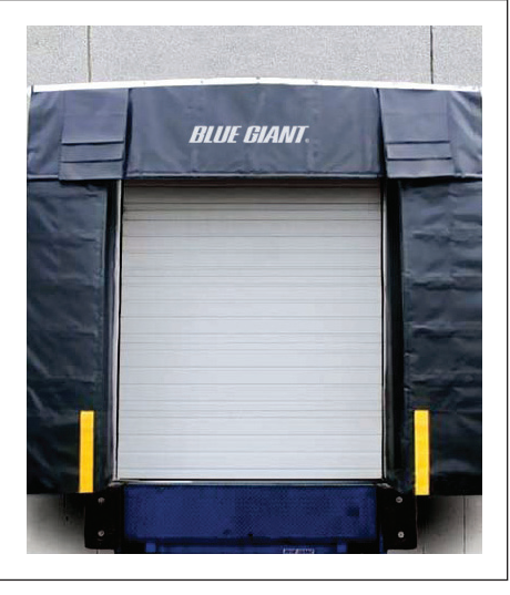
BGDSHF Foam Dock Shelter