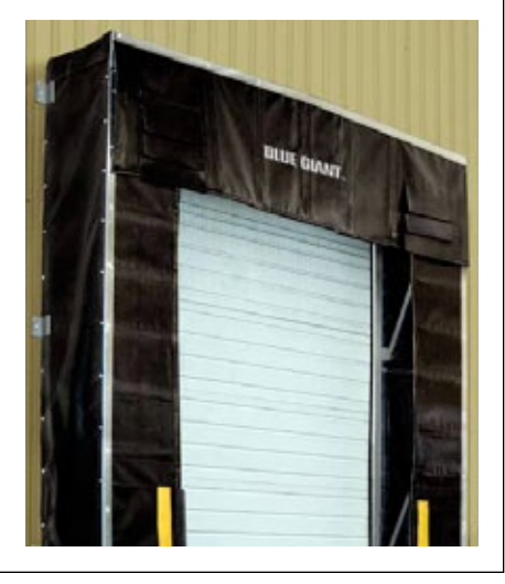
BGDSHR Retracable Dock Shelter